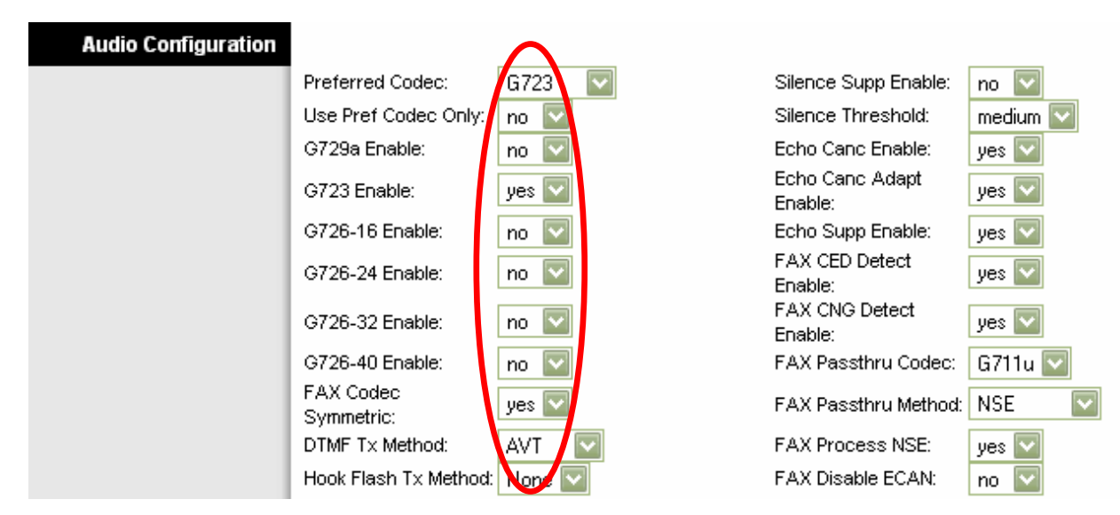
Line 1 Configuration Page - Bottom

11. In the Dial Plan section, change the value of the Dial Plan field to match the dialing pattern used in your country (where you are using the PrimeTalker service).